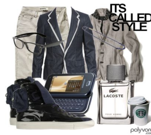
Figure 2 Picture from the blog in “Polyvore.com”

data set that display the phone in an outfit-centric perspective.